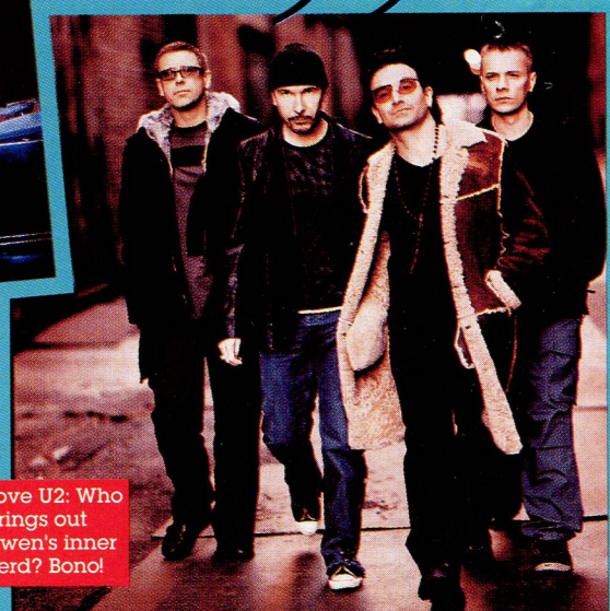
Love U2: Who brings out Gwen's inner nerd? Bono!

being the only girl in No Doubt? What is the worst?