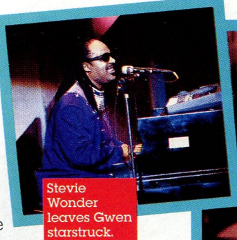
Stevie Wonder leaves Gwen starstruck.