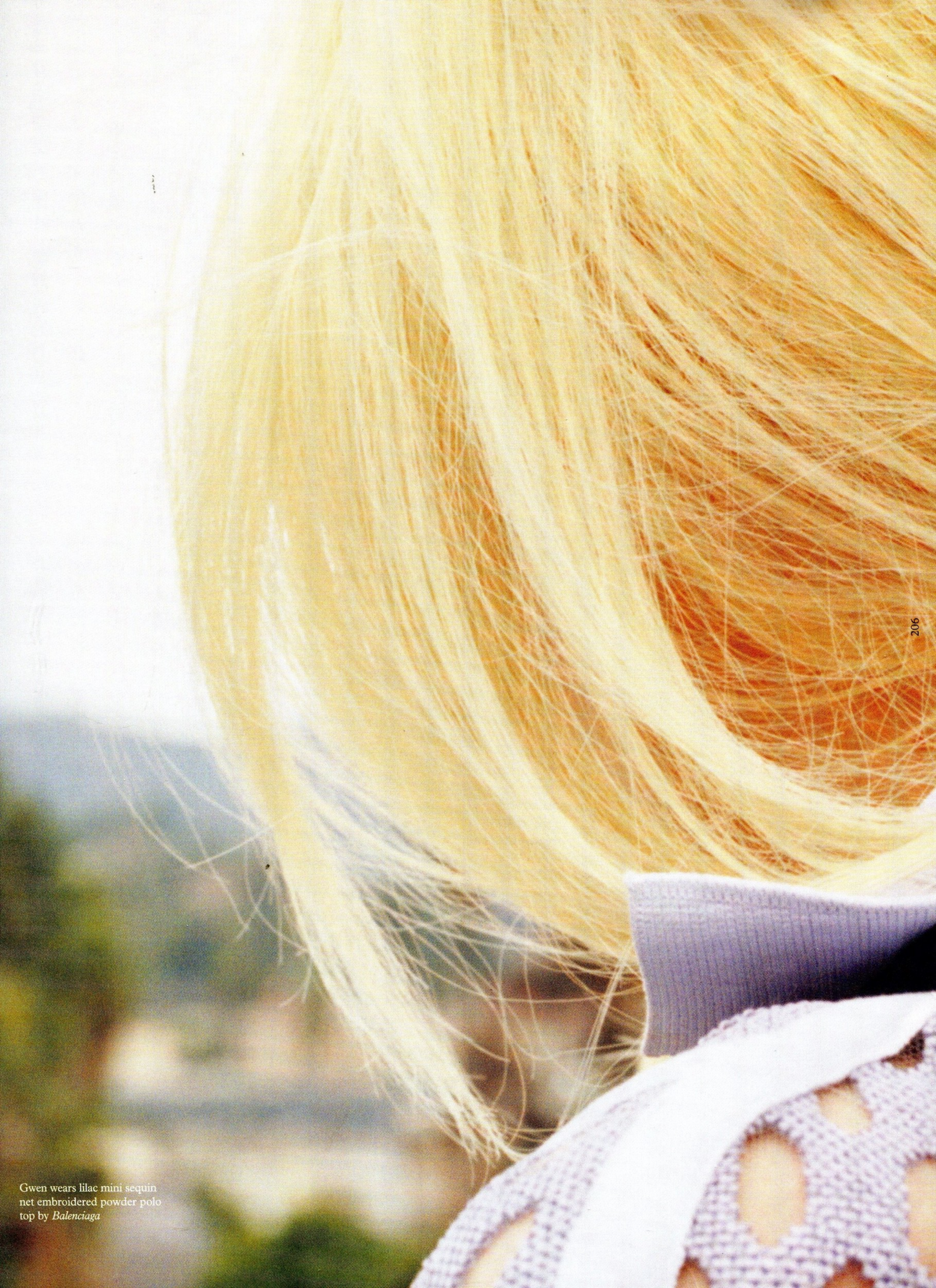
Gwen wears lilac mini sequin net embroidered powder polo top by Balenciaga