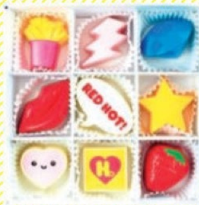
Maggie Louise Confections x Harajuku Lovers Chocolate Box $38