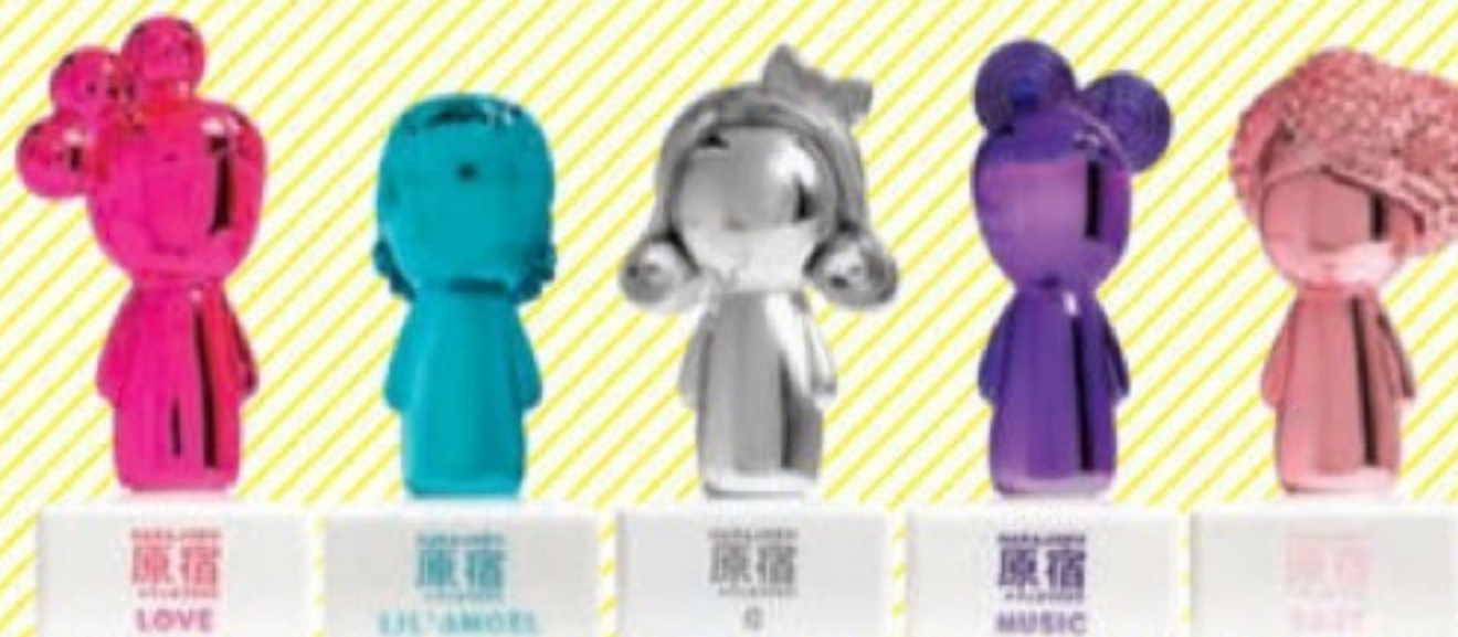
Harajuku Lovers Pop Electric 5-Piece Fragrance Set $125 (or $40 each)