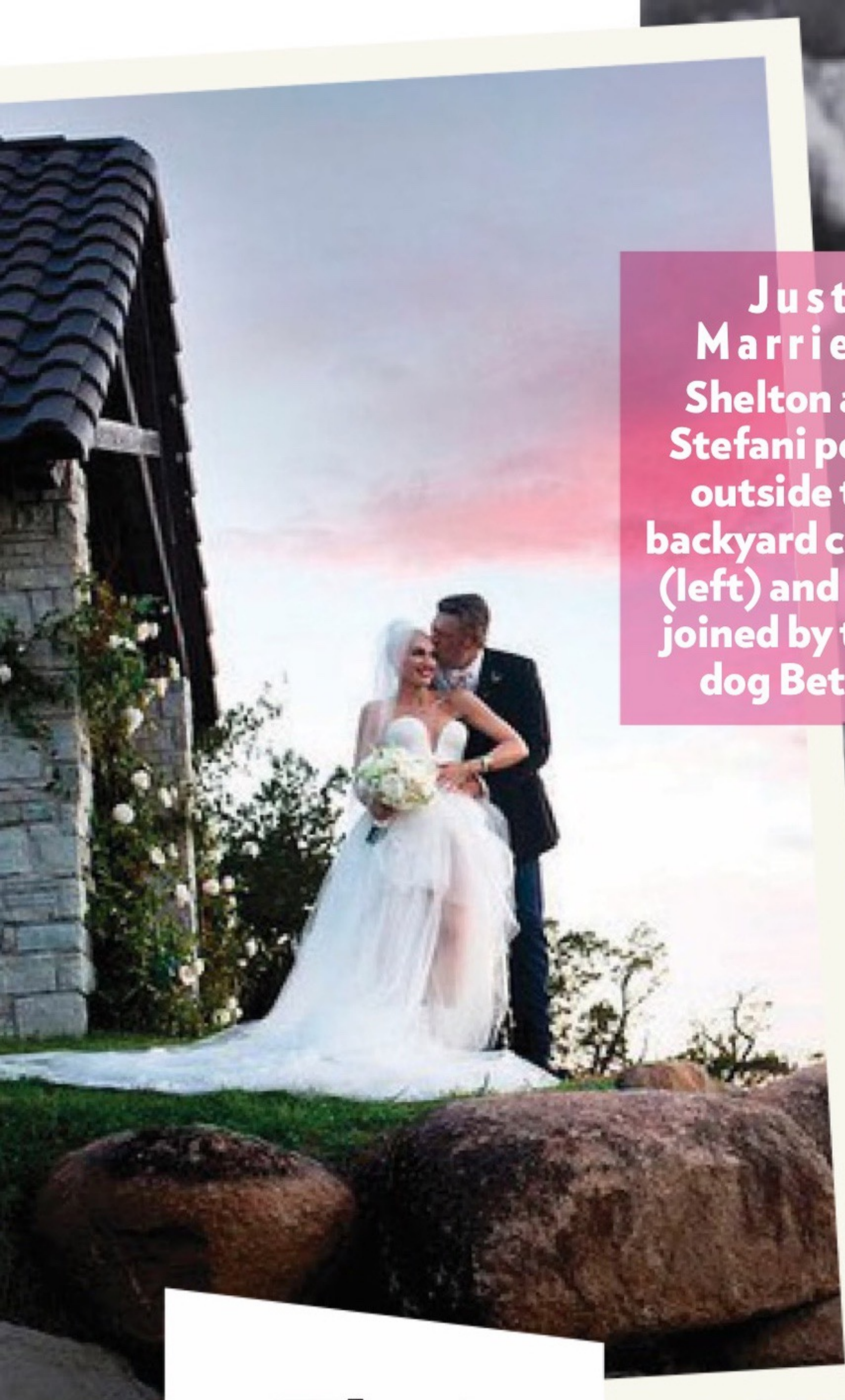
Just Married! Shelton and Stefani posed outside the backyard chapel (left) and were joined by their dog Betty.