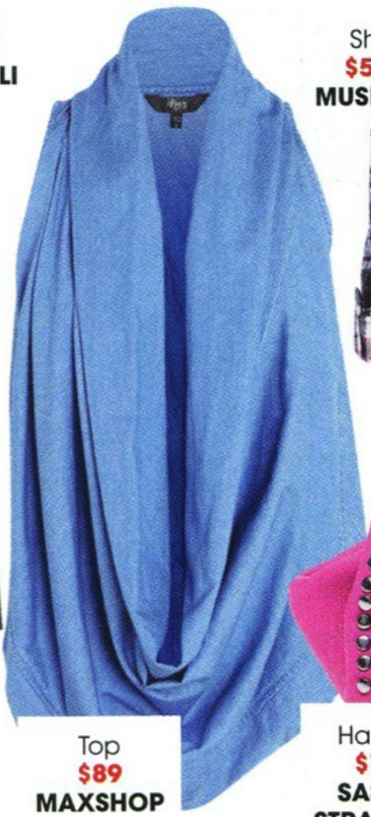
Top $89 MAXSHOP