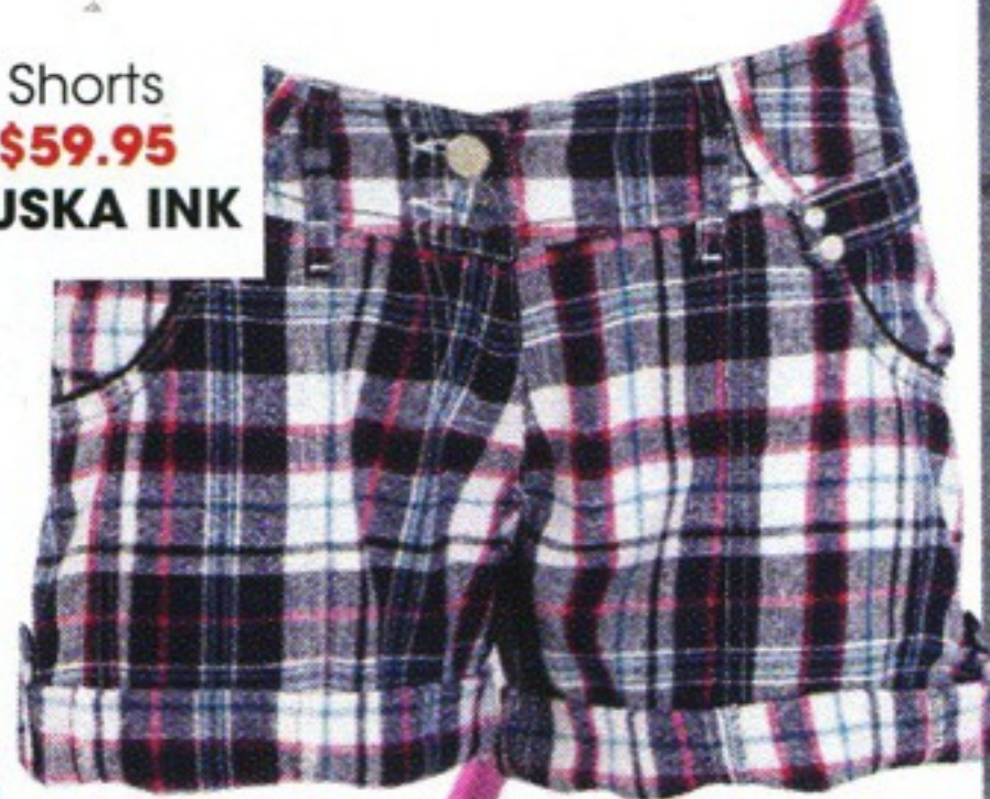
Shorts $59.95 MUSKA INK