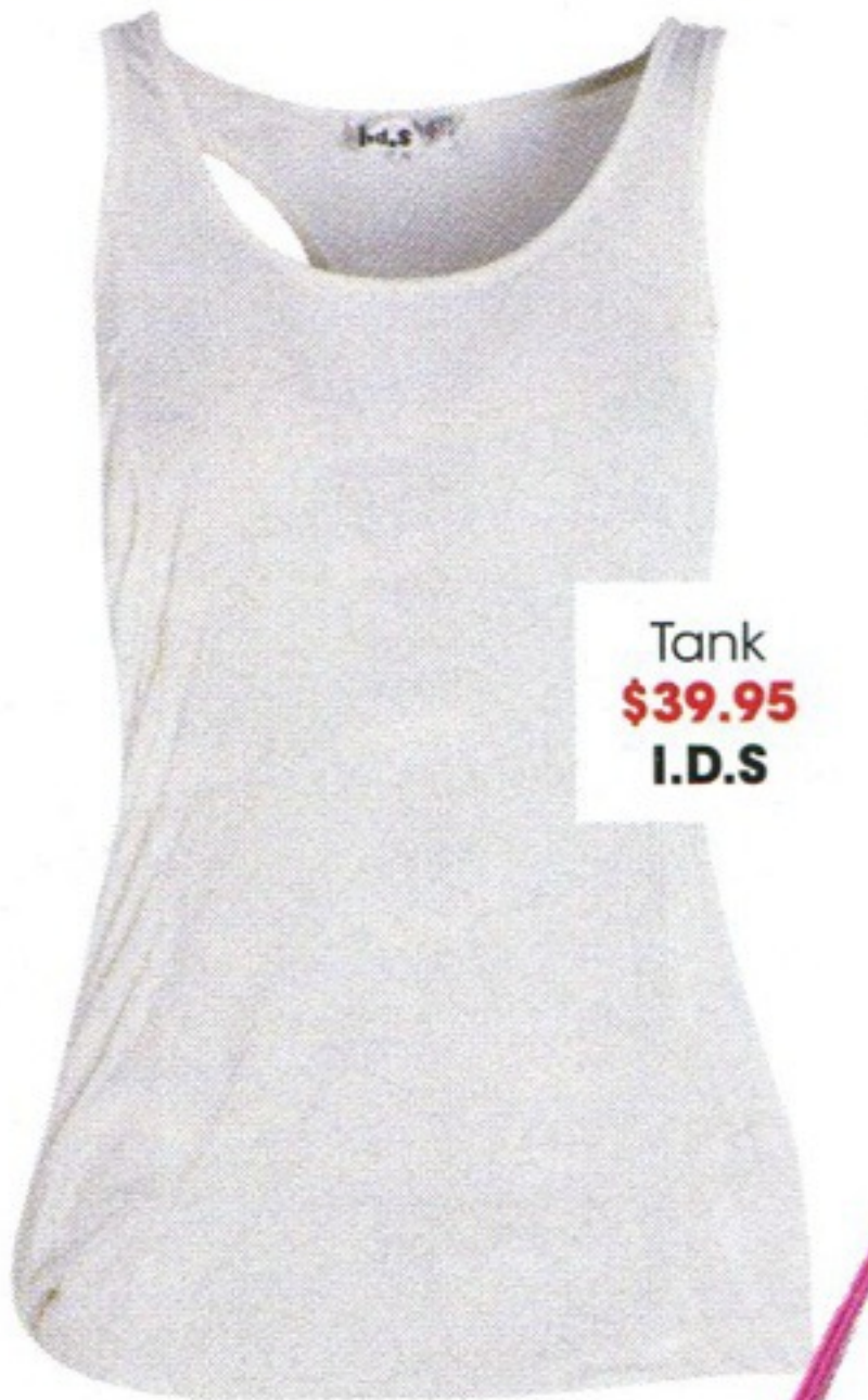
Tank $39.95 I.D.S

ON STAGE OR HANGING WITH THE FAM, GWEN ROCKS A STYLISH WARDROBE