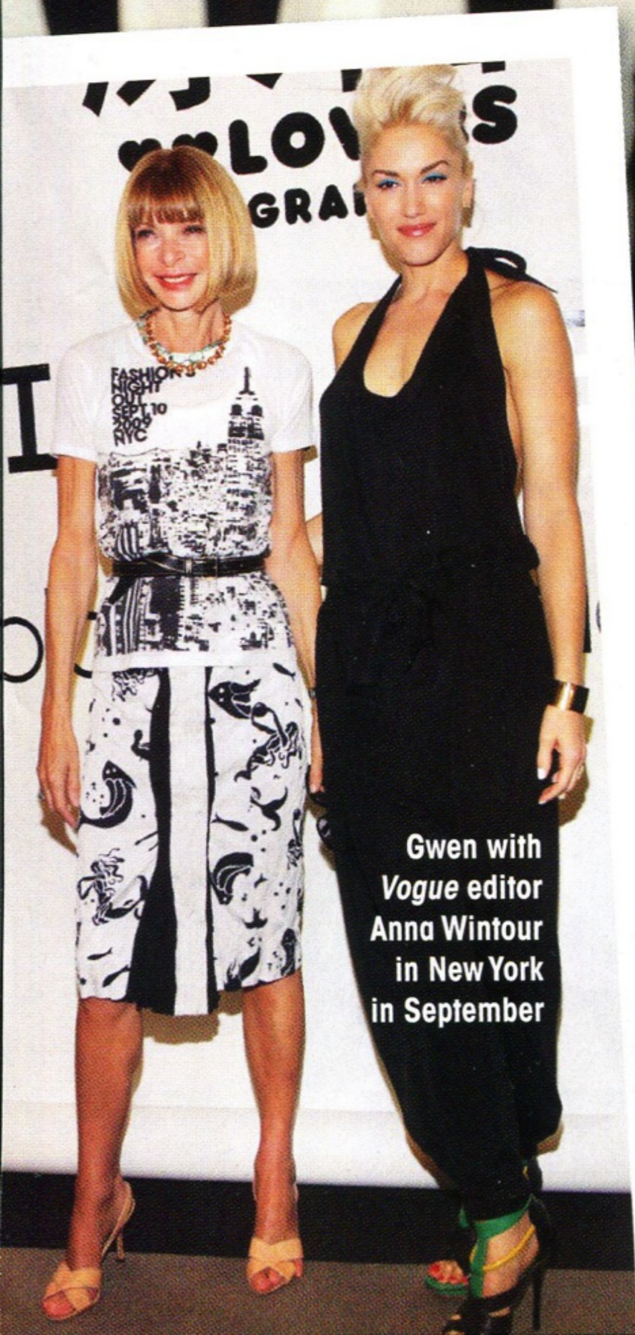
Gwen with Vogue editor Anna Wintour in New York in September

Lead singer, solo artist, fashion designer, fragrance diva and mum – it's hard to believe Gwen Stefani wasn't cool in high school!