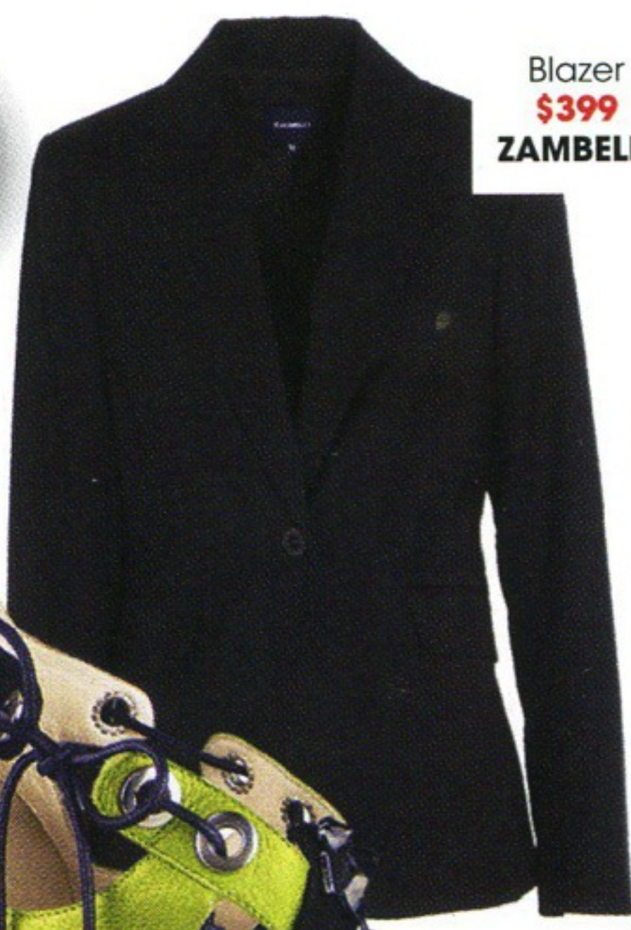
Blazer $399 ZAMBELLI