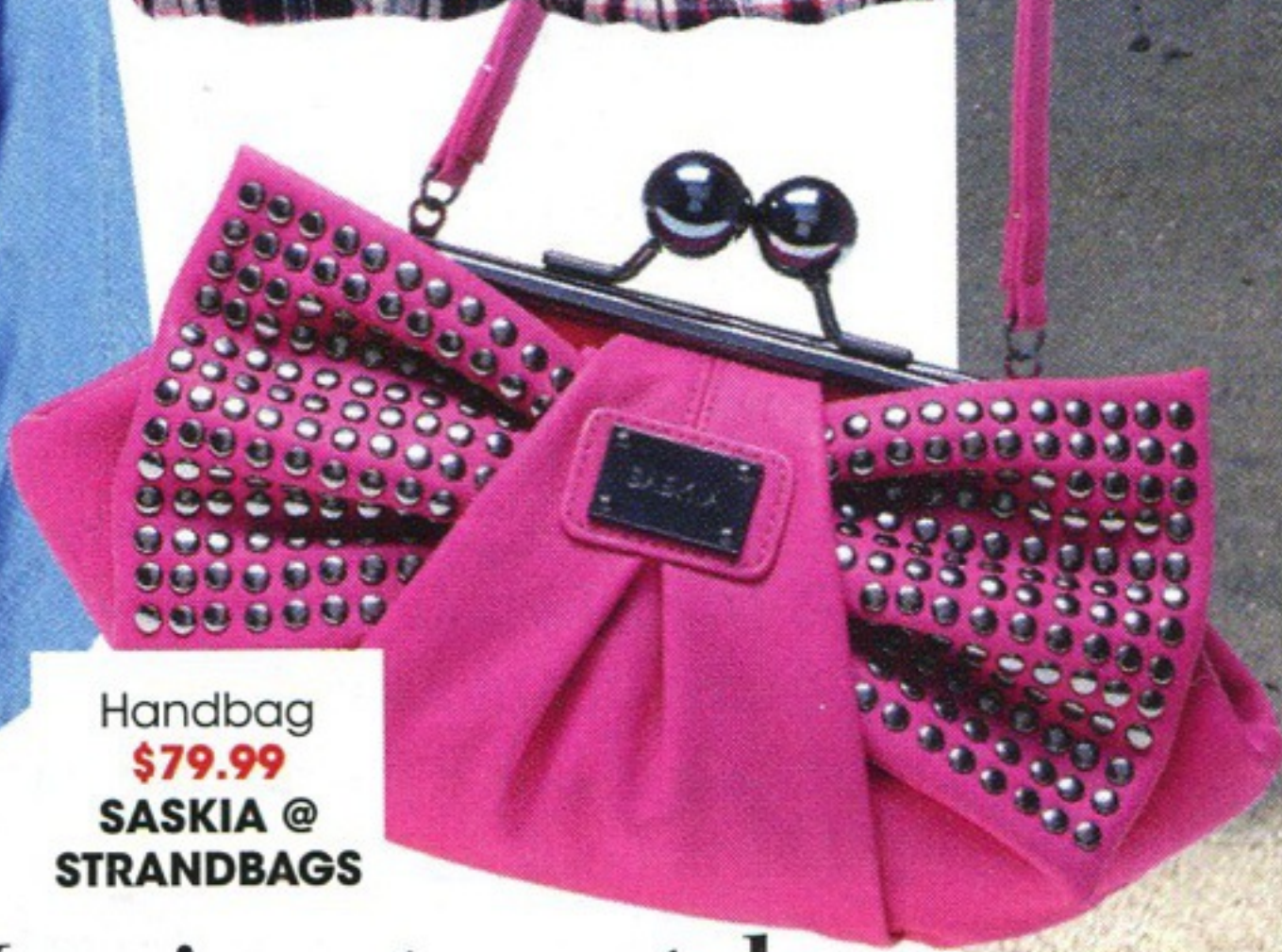
Handbag $79.99 SASKIA @ STRANDBAGS