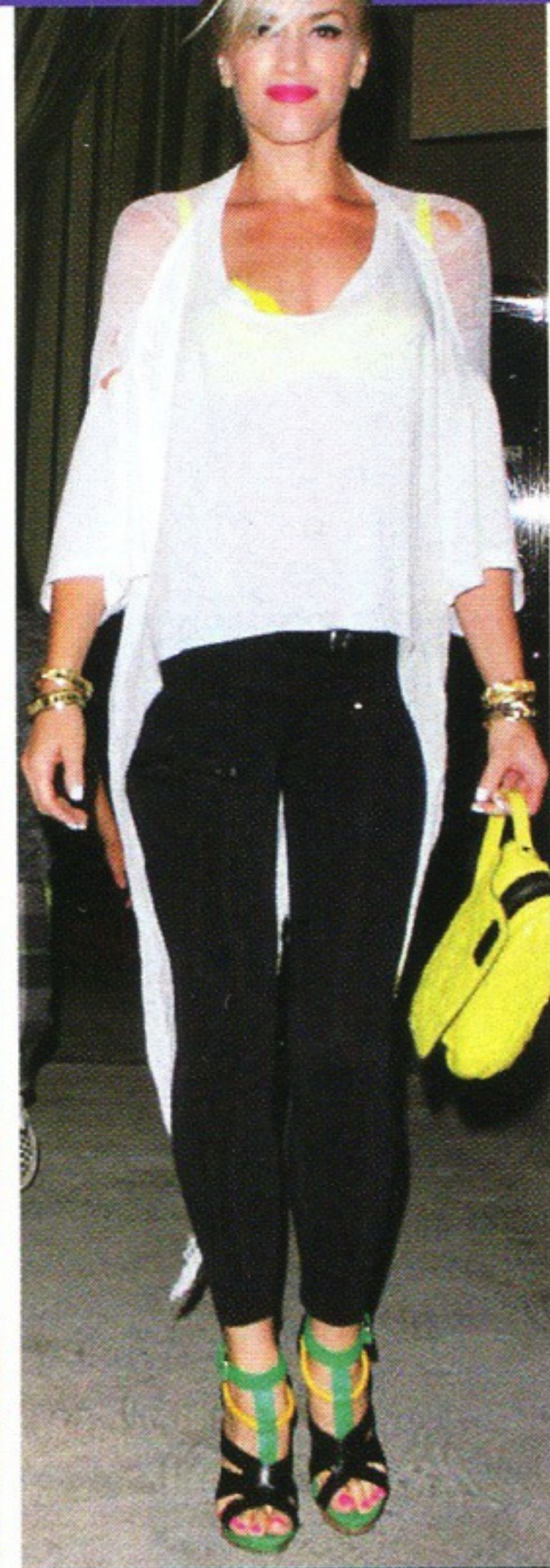
POP COLOUR The singer mixes L.A.M.B.'s bold and classic colours to watch hubby Gavin Rossdale at the Donate Life Concert.