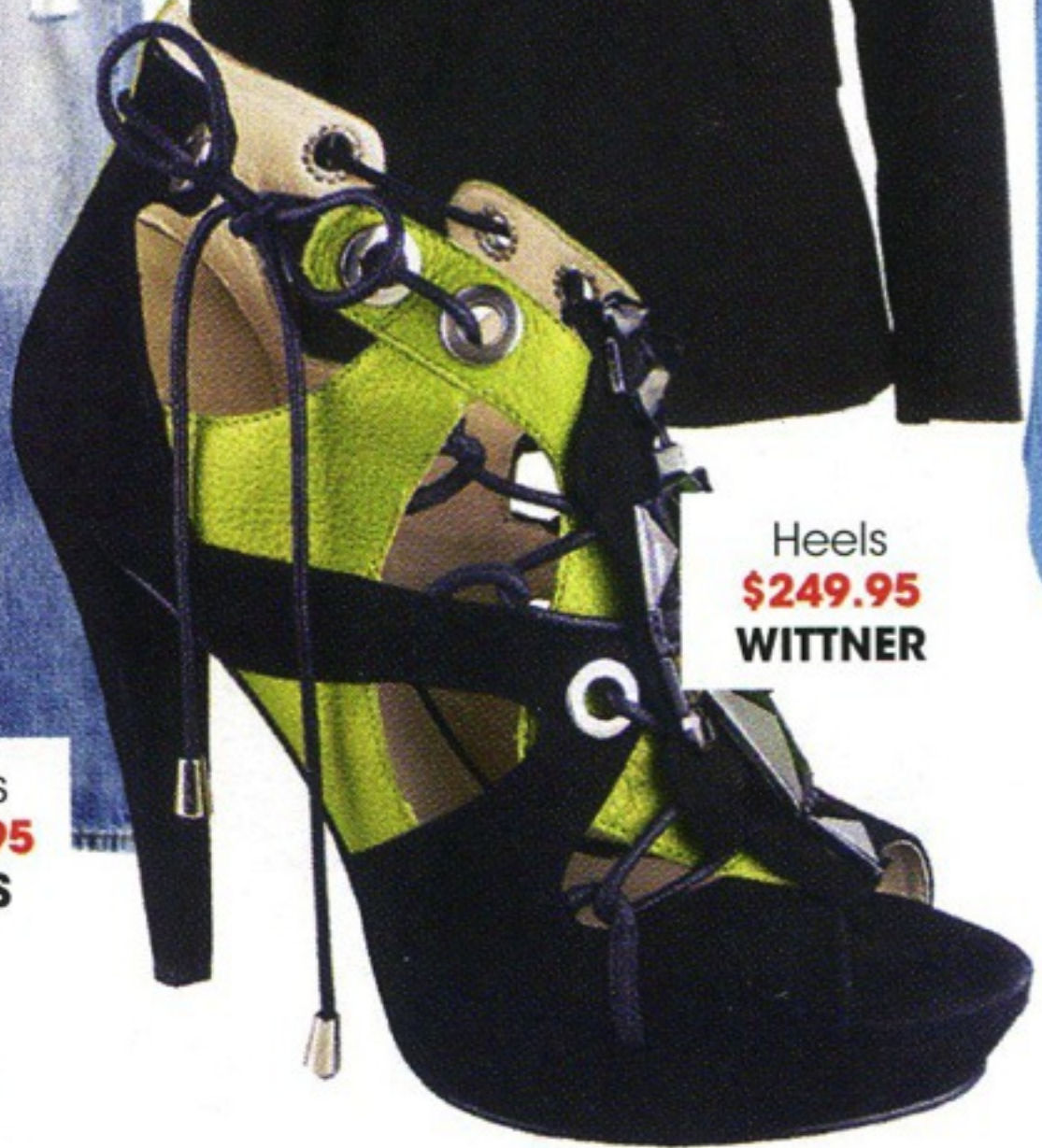
Heels $249.95 WITTNER