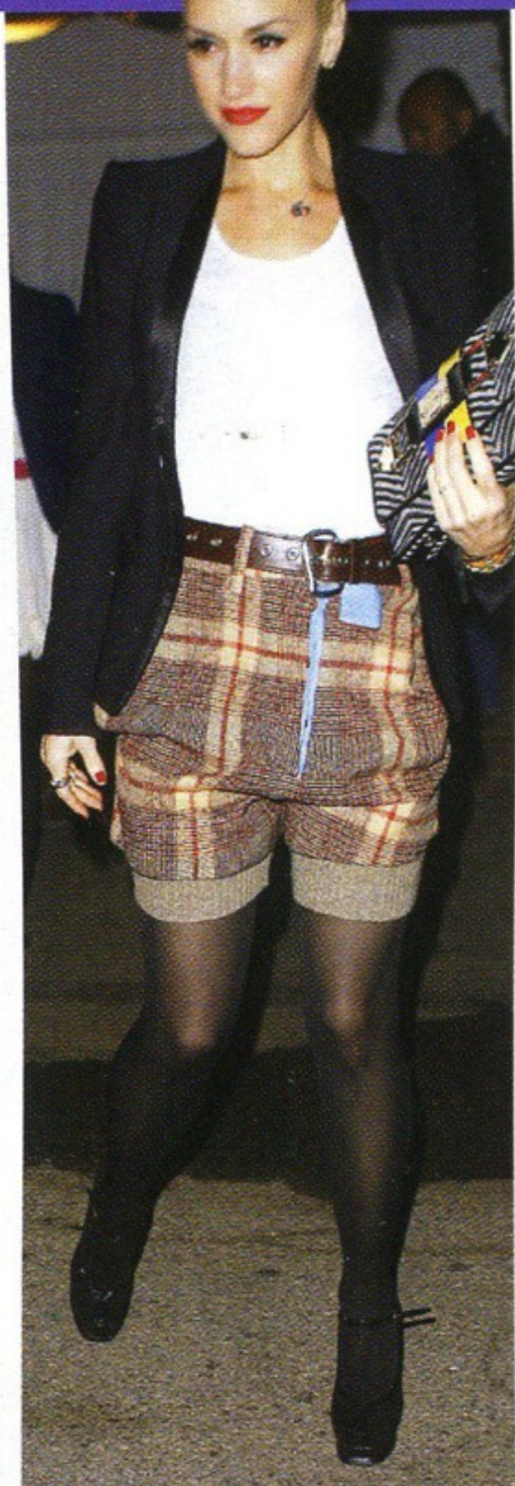
CHECK MATE Heading to Kate Hudson's birthday in a Maison Martin Margiela tux jacket and Vivienne Westwood shorts.

WHERE TO BUY: I.D.'S (03) 9417 0626 LEVI'S 1800 686 305 MAXSHOP (03) 9416 337 / STRANDBAGS (03) 9417 7171 WITTNER (03) 9417 0626 ZAMBELLI (02) 8565 7575 TEXT AND STYLING BY YELINA FAIRFAX