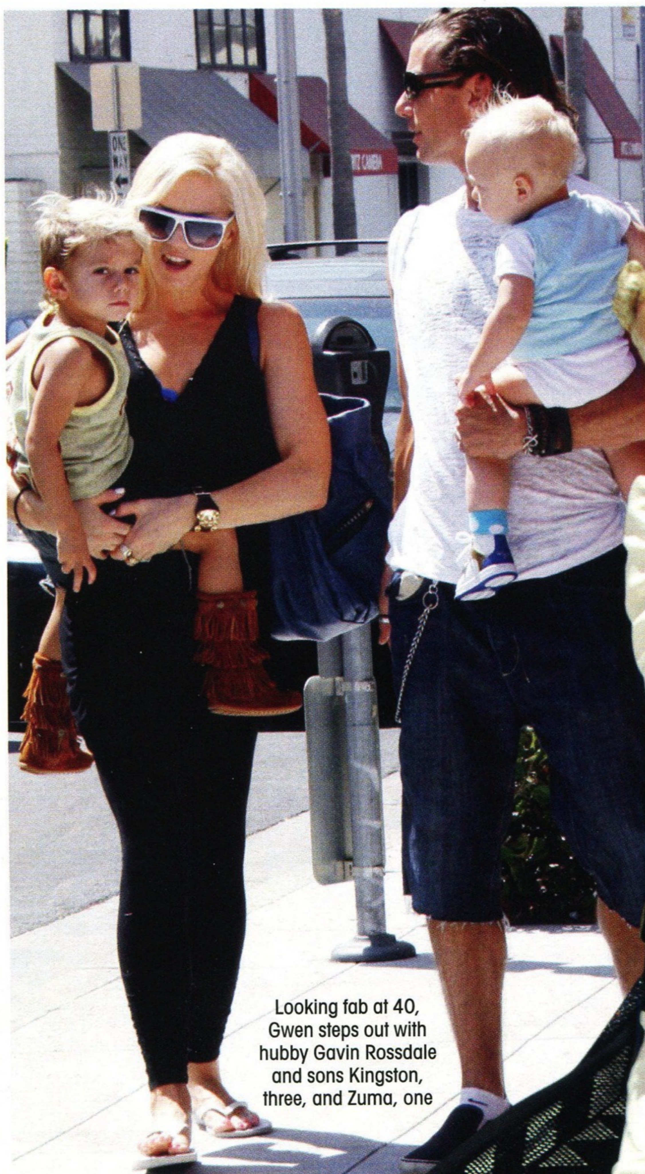
Looking fab at 40, Gwen steps out with hubby Gavin Rossdale and sons Kingston, three, and Zuma, one

Who's your favourite fashion designer? Who's inspired you the most? Vivienne Westwood. I'm a Vivienne Westwood maniac! The first fashion show I ever went to was Vivienne Westwood. Talk about stealing her ideas!