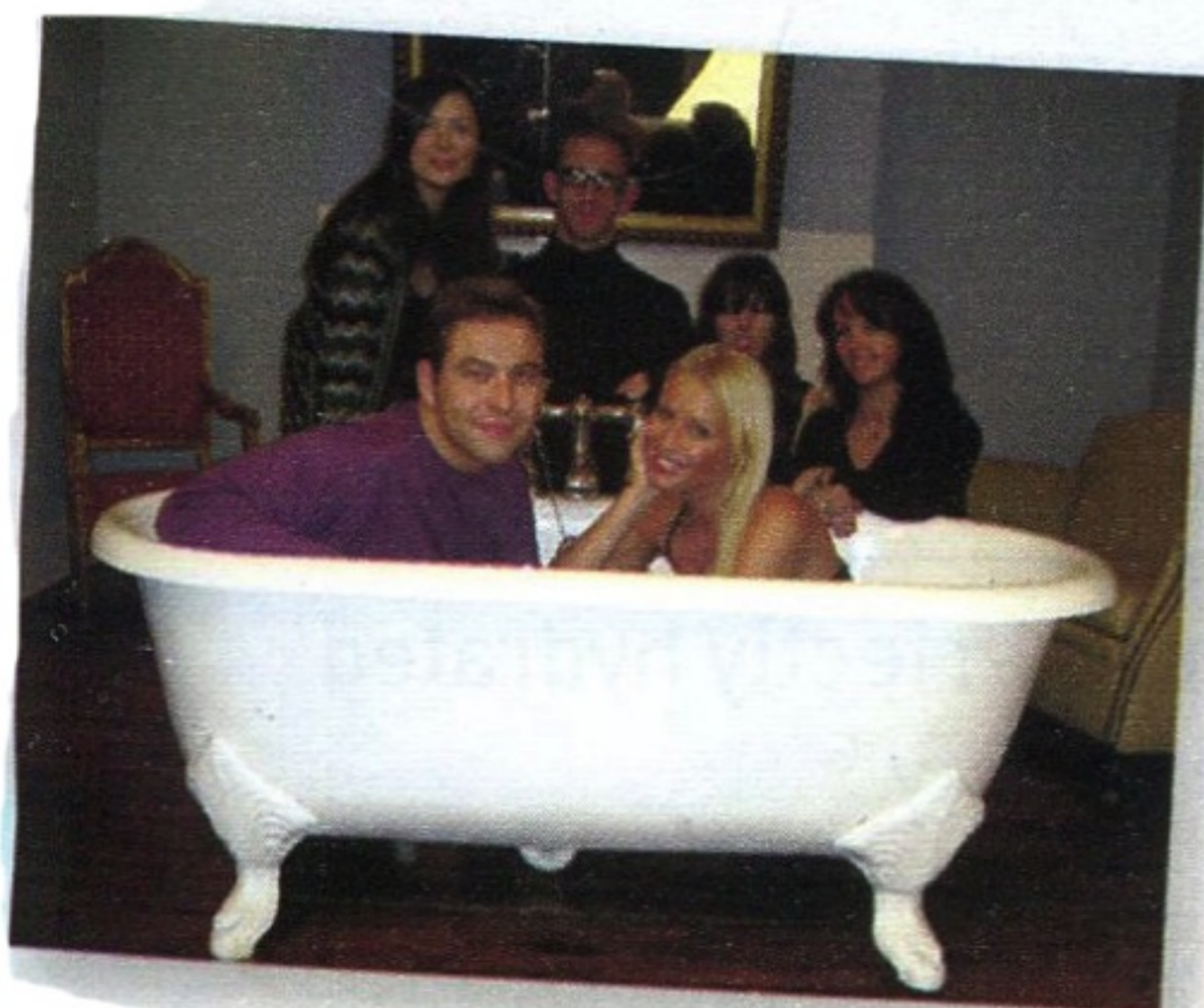
David Walliams with Denise Van Outen and the GLAMOUR shoot team