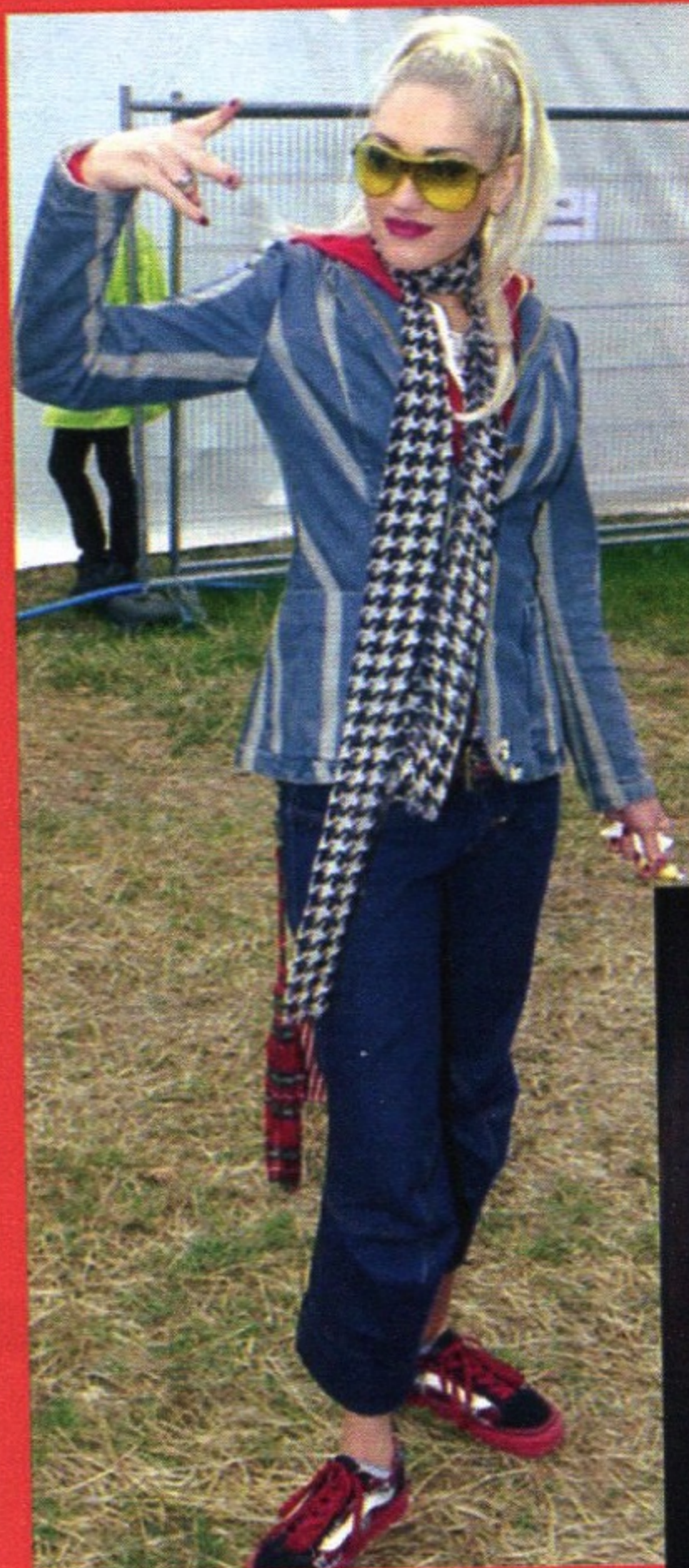
▲ Glastonbury, June 2002 “We were on the Rock Steady tour. The band really wanted to do the festivals and I was, ‘You know what? I’ve been to enough rough parties, I don’t want to do them any more.’ But I did it for them. I’m not a tent type. I used to be. For 12 years. But I’ve sold out. I’m a woman now.”

Gwen gives GLAMOUR the lowdown on some of her most memorable looks