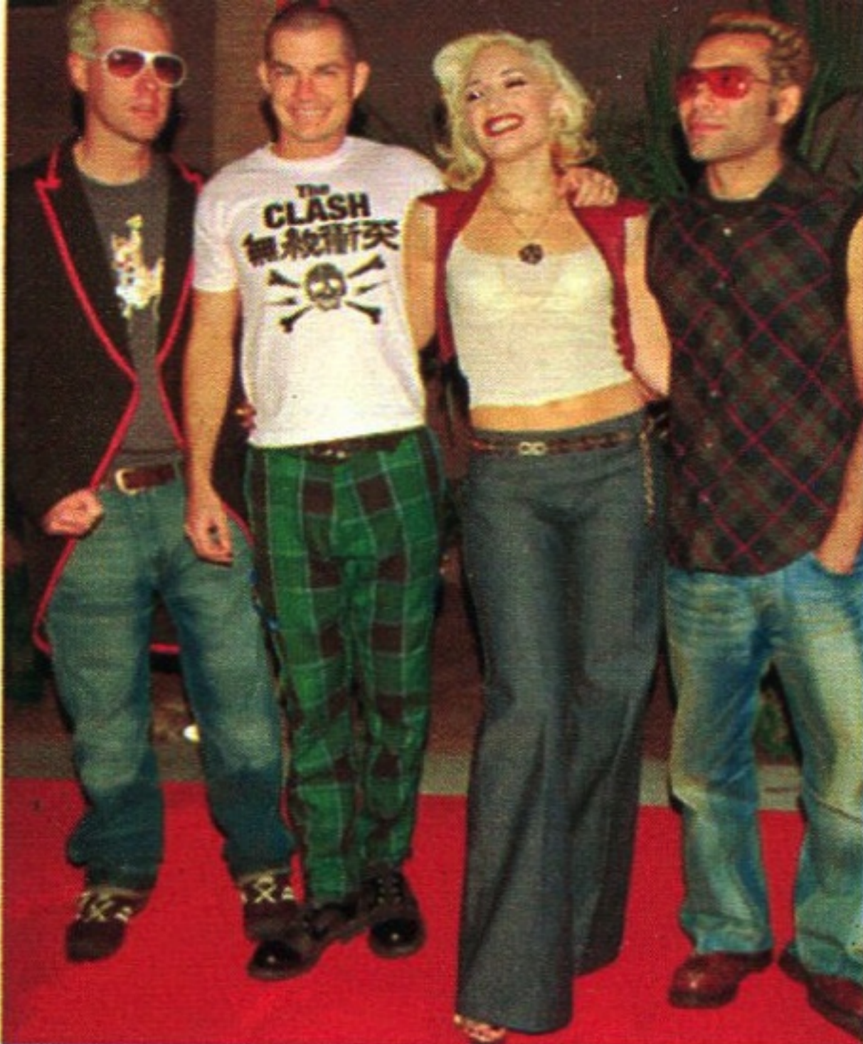
Left: Gwen with the chart-topping No Doubt Below: With rock star husband Gavin Rossdale

"Having the creative life of being devoted to a band is intense," notes Gwen, "so having a partner who is doing the same thing is a blessing. Someone who understands through all those years of living in different countries. Since we've been engaged [New Year's Day, 2002]