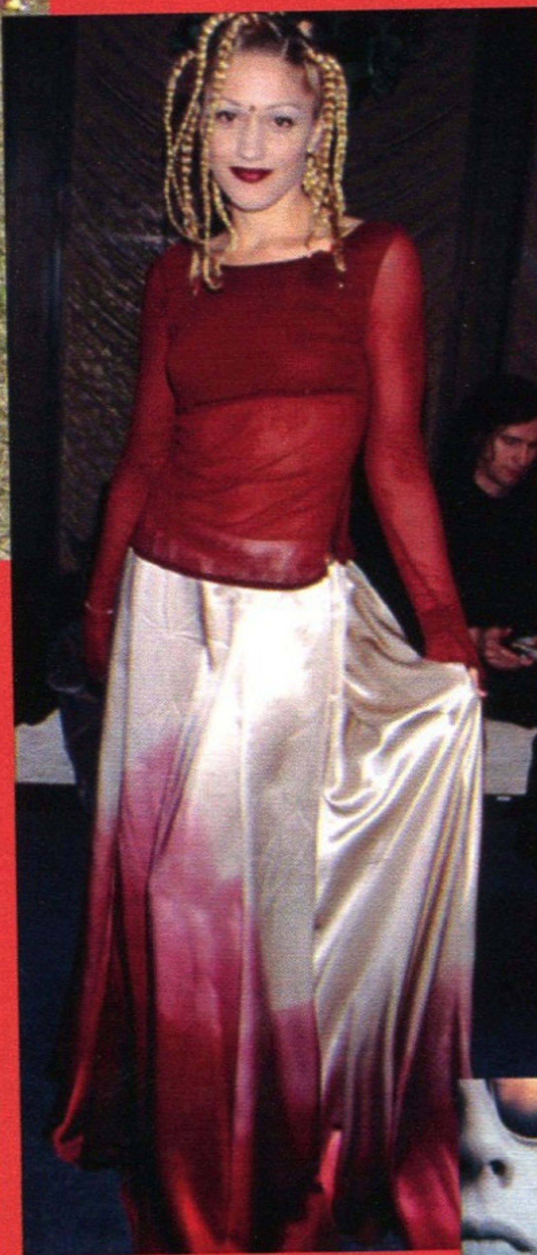
▼ The Aviator premiere, December 2004 “That’s a Vivienne Westwood. People liked that one. That night was weird because the scene that I play is in Mann’s Chinese Theatre where the premiere was. So we were sitting in the Mann’s Chinese Theatre, watching me on screen in Mann’s Chinese Theatre watching the original movie Jean Harlow was in. It was really cool.”