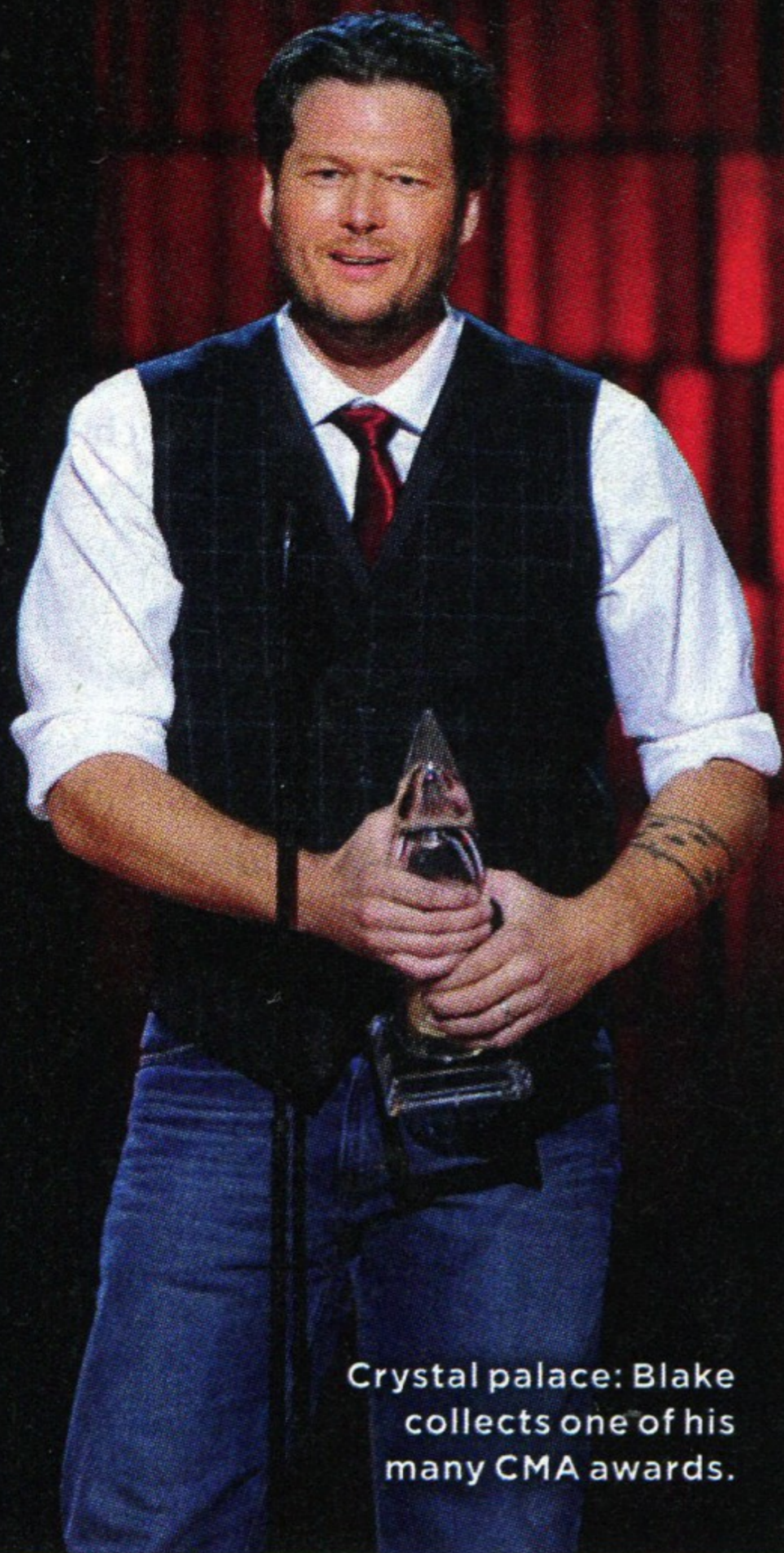
Crystal palace: Blake collects one of his many CMA awards.

“I’m very content, and who wouldn’t be? I know how lucky I am and I’ll be happy if it stays like this for a long time.”