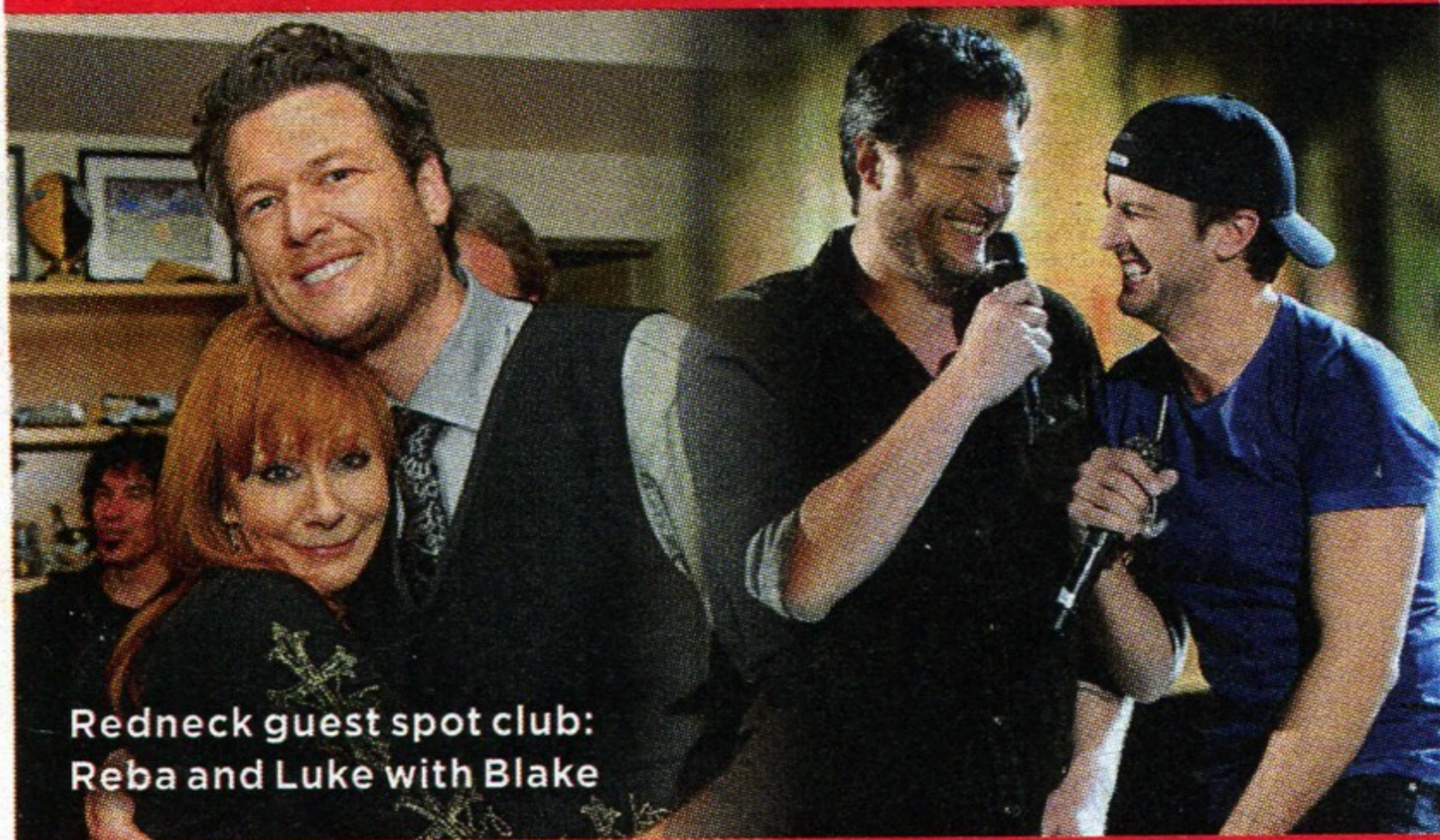
Redneck guest spot club: Reba and Luke with Blake