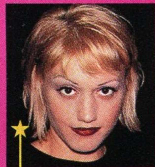
★ 1998 Just a girl next door.