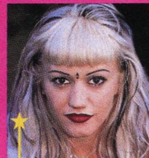
★ 1996 Blondie with a bindi.