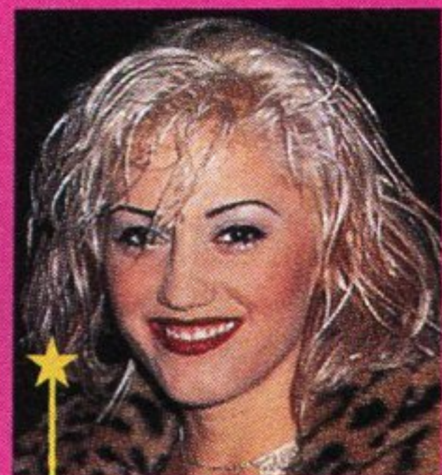
★ 1996 Mayor of scrunch city.