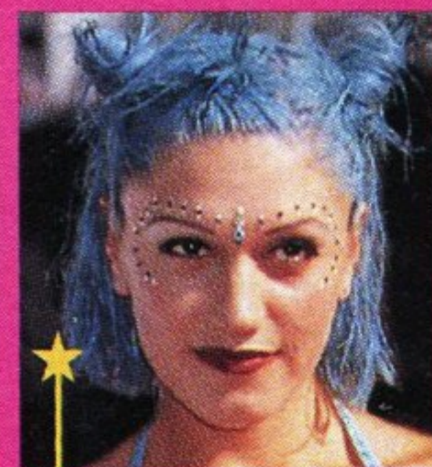
★ 1998 Lady wears the blues.