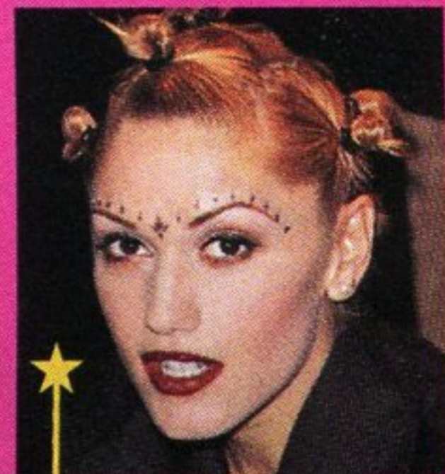
★ 1997 Knot a bad look.