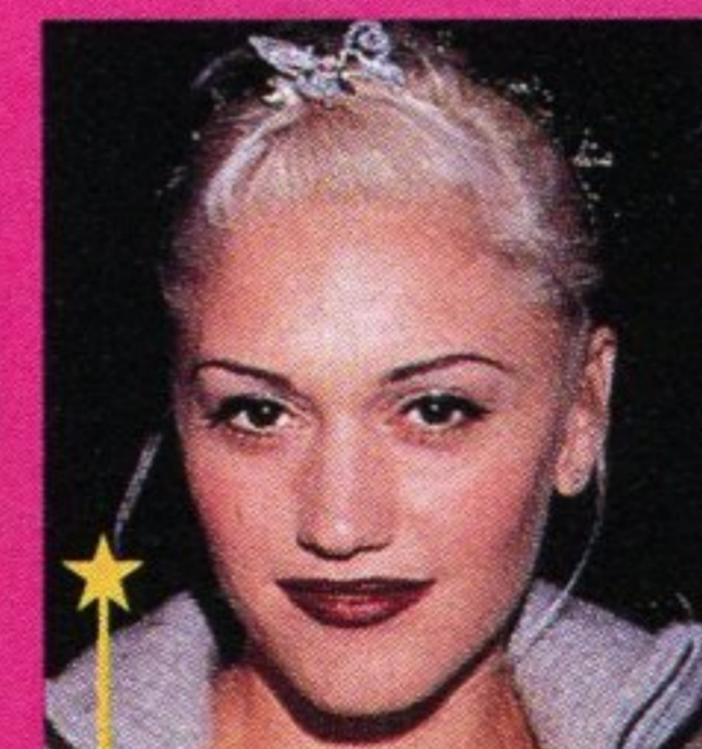
★ 1999 Bugging with butterflies.