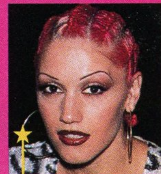
★ 2000 Corny—but cool!

Hairstyles, left column, from top: TOM MOSENFELDER/CORBIS IMAGES; STEVE SANDS/CORBIS OUTLINE; GERARDO SOMOZA/CORBIS OUTLINE; PACE/CORBIS SYGMA; RON WOLFSON/LONDON FEATURES; DENNIS VAN TINE/LONDON FEATURES. Right, from top: STEVE SANDS/CORBIS OUTLINE;