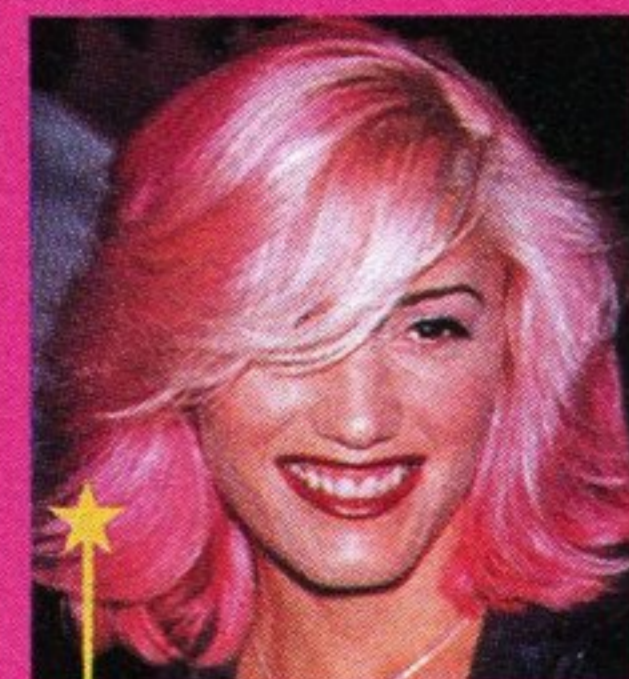
★ 1999 Mmm... cotton candy.