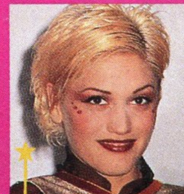
★ 1997 The kindest cut.