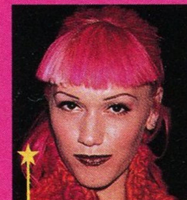
★ 1999 Really banging it out.