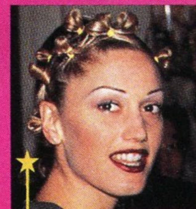
★ 1998 She's a twisted sistah.