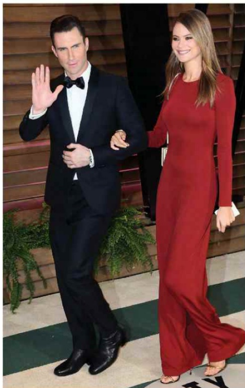
“I tell you, when we first started doing this? I remember being so scared at first,” admits Levine (shown attending the Vanity Fair Oscar Party with his wife, Behati Prinsloo, in Hollywood on March 2). “I was like, ‘What am I doing? This is insane.’”

Still, NBC seems unsure how to package Williams. In an expensively