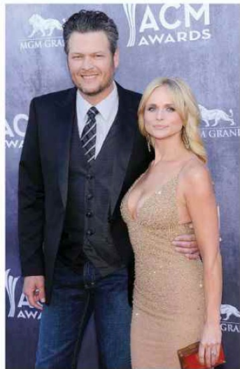
"Has an international superstar come off the show? No, but Cassadee Pope's first single was top 10. She's got a platinum song," says Shelton (above), shown posing with Lambert on the red carpet at the Academy of Country Music Awards in April.

Shelton has the kind of nice, easy buttermilk drawl that makes you want to believe everything he says. And yet his comment can hardly be taken as a defense of his show, the last music competition you'd expect to discover the next Miranda Lambert. On The Voice this season, it's Stefani and Williams facing the biggest blind auditions of their lives. And for the next superstar, maybe they're better off trying to find his or her video on YouTube. But millions of people will still be entertained and watching. ●