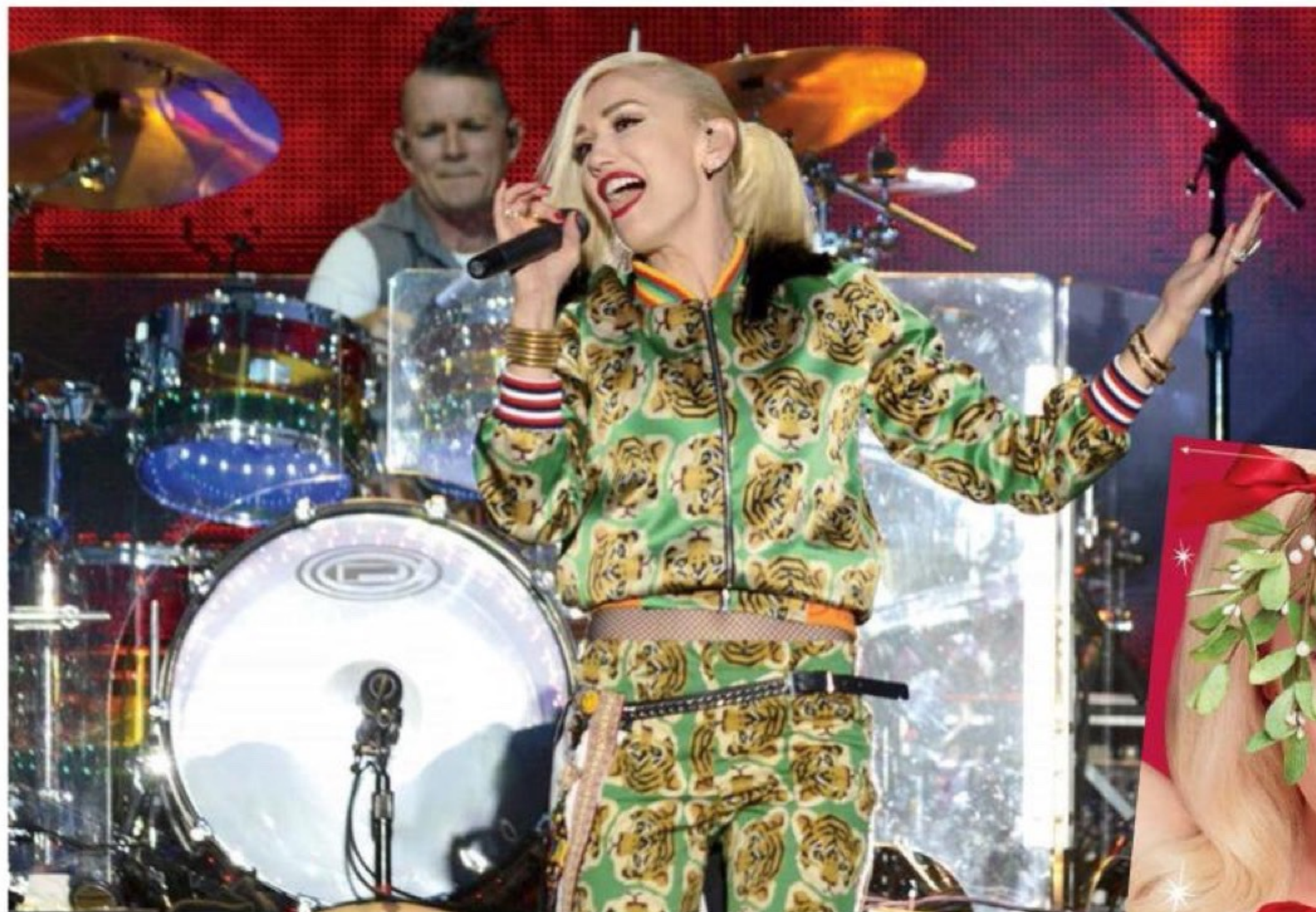
Stefani had wanted to write and record a Christmas album for years, but never found the time until now. Inset: You Make It Feel Like Christmas arrives Oct. 6.

Sia, untitled The pop star will christen her new label home at Atlantic with her first Christmas album at the end of 2017, featuring all original holiday songs written by Sia and collaborator Greg Kurstin . —L.H.