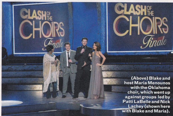
(Above) Blake and host Maria Menounos with the Oklahoma choir, which went up against groups led by Patti LaBelle and Nick Lachey (shown here with Blake and Maria).

But, whether he likes it or not—and truck-driving deer notwithstanding—the third-place finish of his choir in the New York competition, and the sweat and anxiety he put into directing his fellow Okies, have