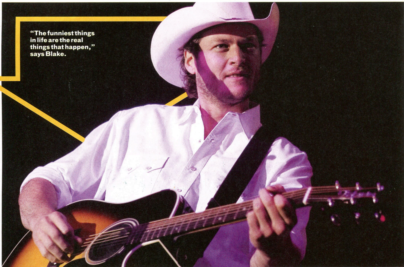
BLAKE SHELTON ; MIRANDA LAMBERT

"The funniest things in life are the real things that happen," says Blake.