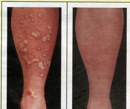
SkinZinc user BEFORE...and AFTER.

Finally! Relief for people who suffer from Psoriasis, Eczema, Dermatitis or other irritating skin disorders! Introducing SkinZinc , the revolutionary skin treatment system, clinically proven to provide immediate relief from irritating skin disorders.